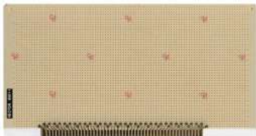
Prototype Board Manufactured by Vector Electronics http://www.vectorelect.com/

The following two sites provide excellent tutorials for the beginner PIC enthusiast.