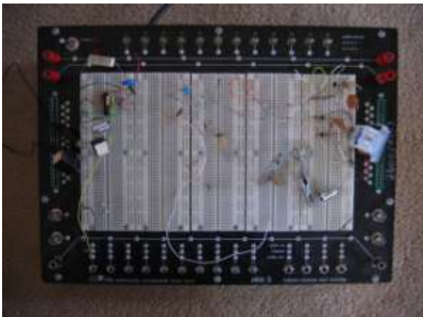
Sample Prototype Board manufactured by E & L Instruments: http://www.elinstruments.com/