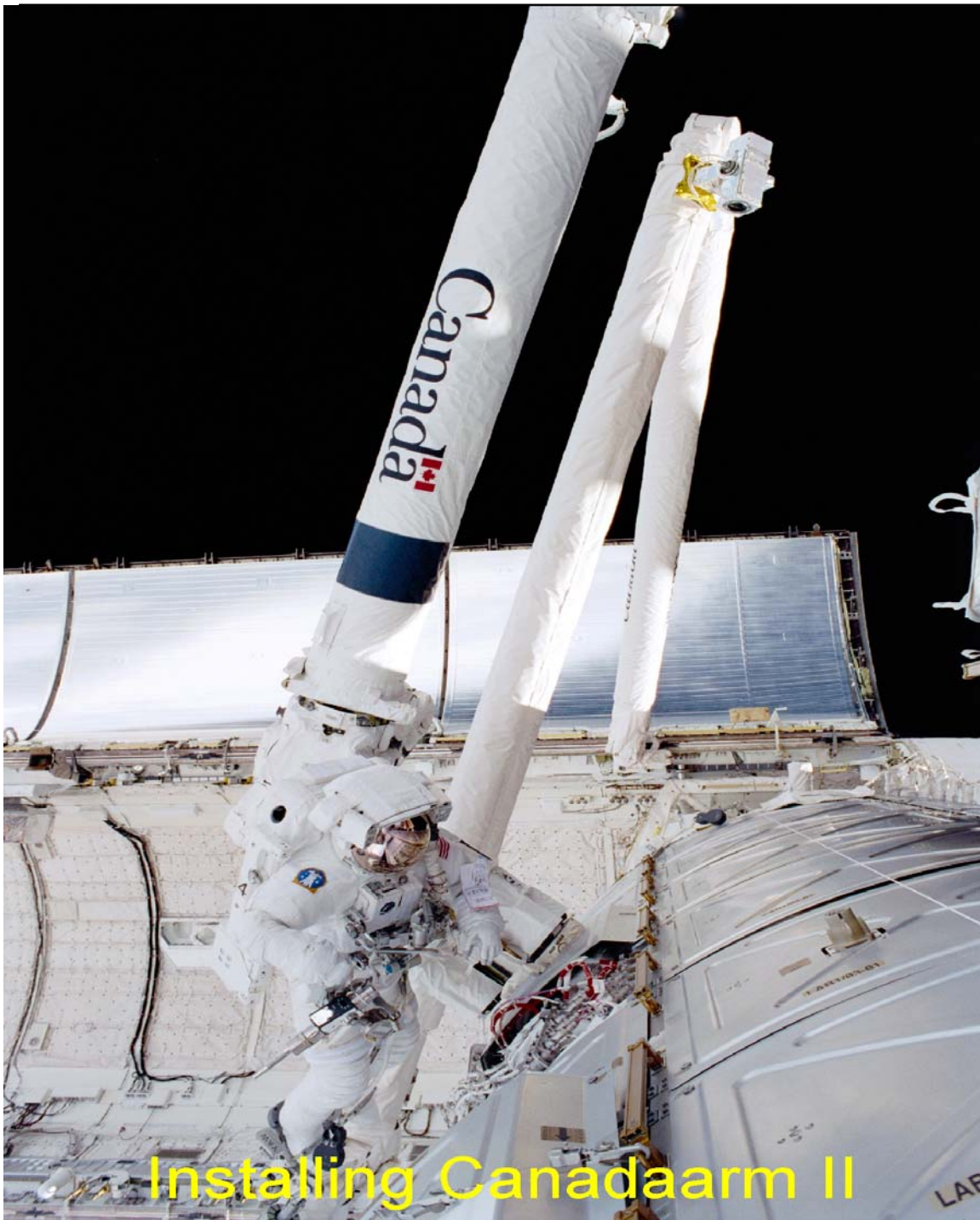
Installing Canadaarm II